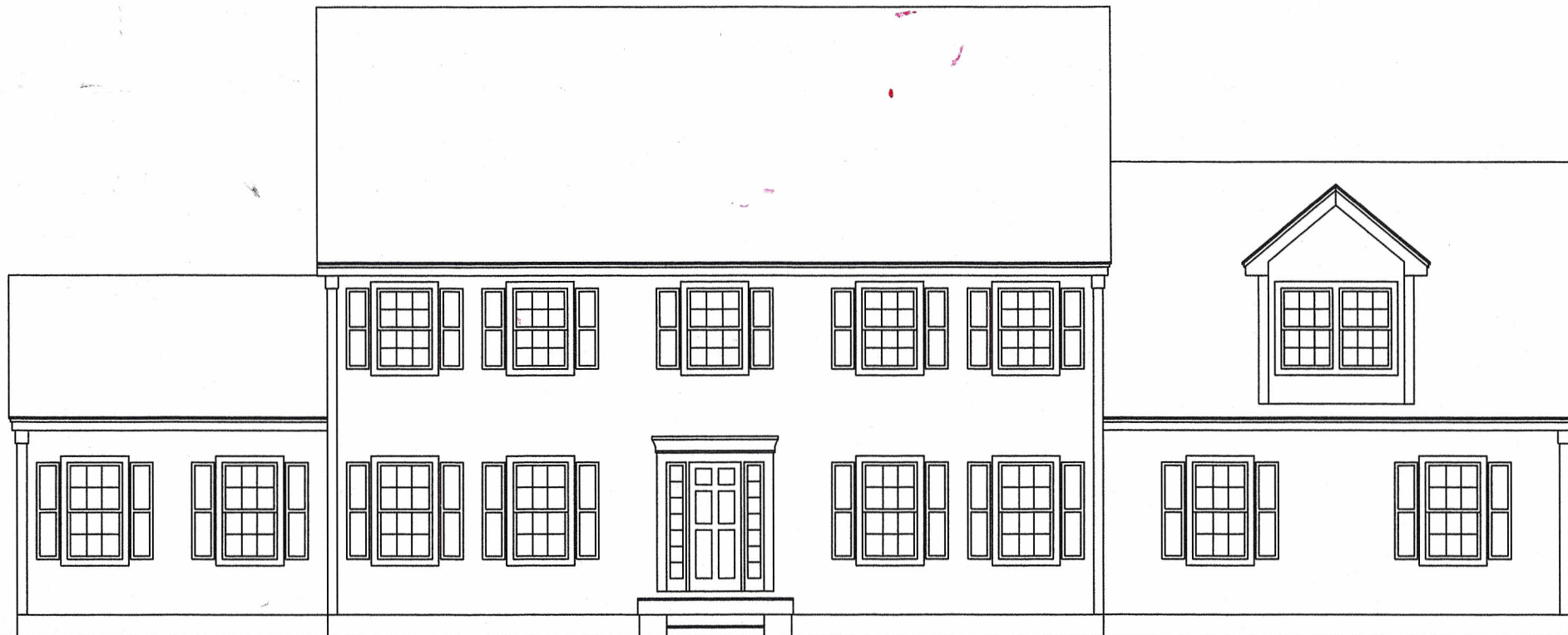
FRONT ELEVATION 3/16'' = 1'-0